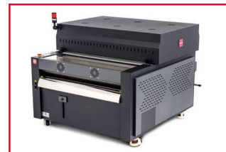
Inline 900 Pro