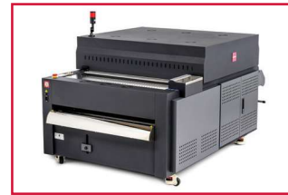
Pro Cure Oven