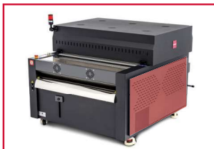
Compact 600 Compact 900

3. Pull the old filters out and install the new filters (carbon at the bottom)